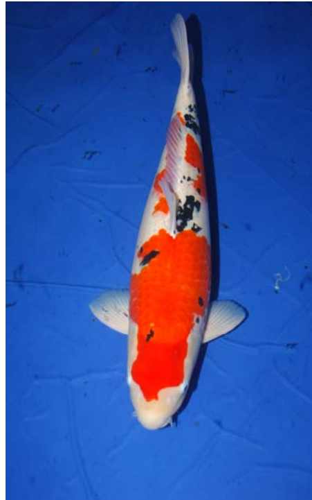
Reserve Grand Champion, photo courtesy Bob Brudd