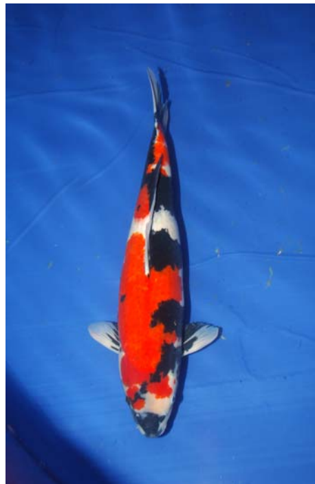
Mature Champion