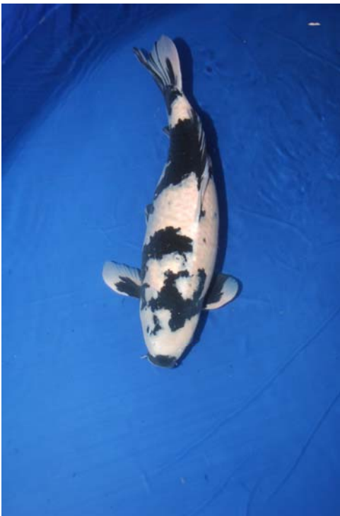
Grand Champion B