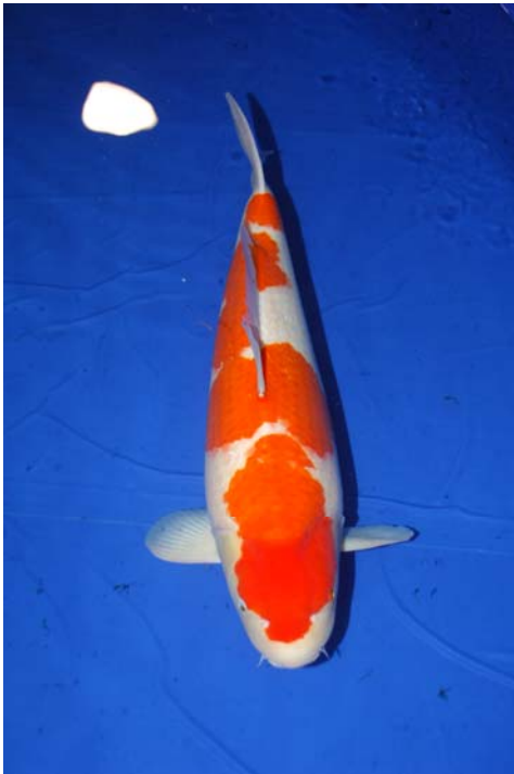
Grand Champion