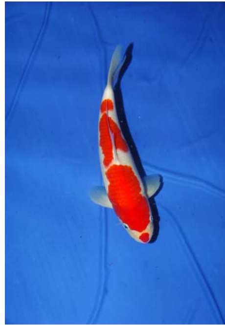
Baby Grand Champion