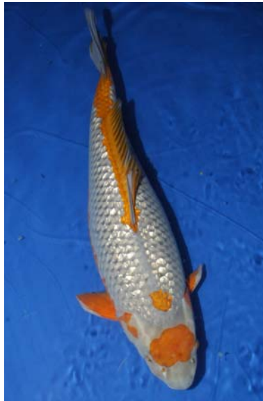
The "Millie" Award