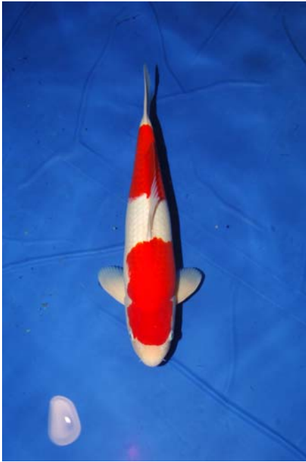
Junior Grand Champion, photo courtesy Bob Brudd